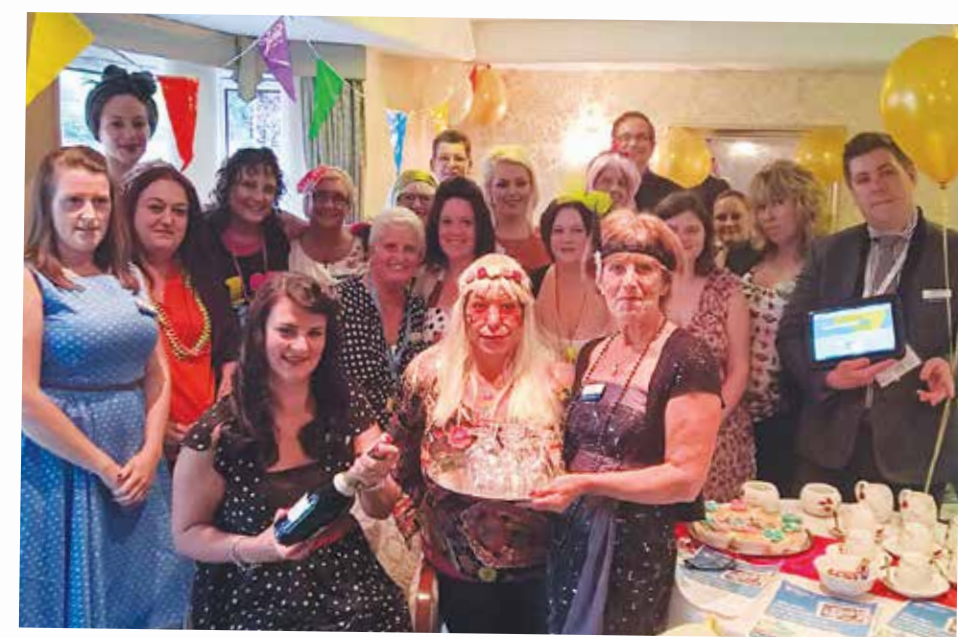
The launch at Regent, which coincided with an event celebrating fashion across the decades

ECPs are easy and safe to use and care plans can be amended and updated efficiently, improving